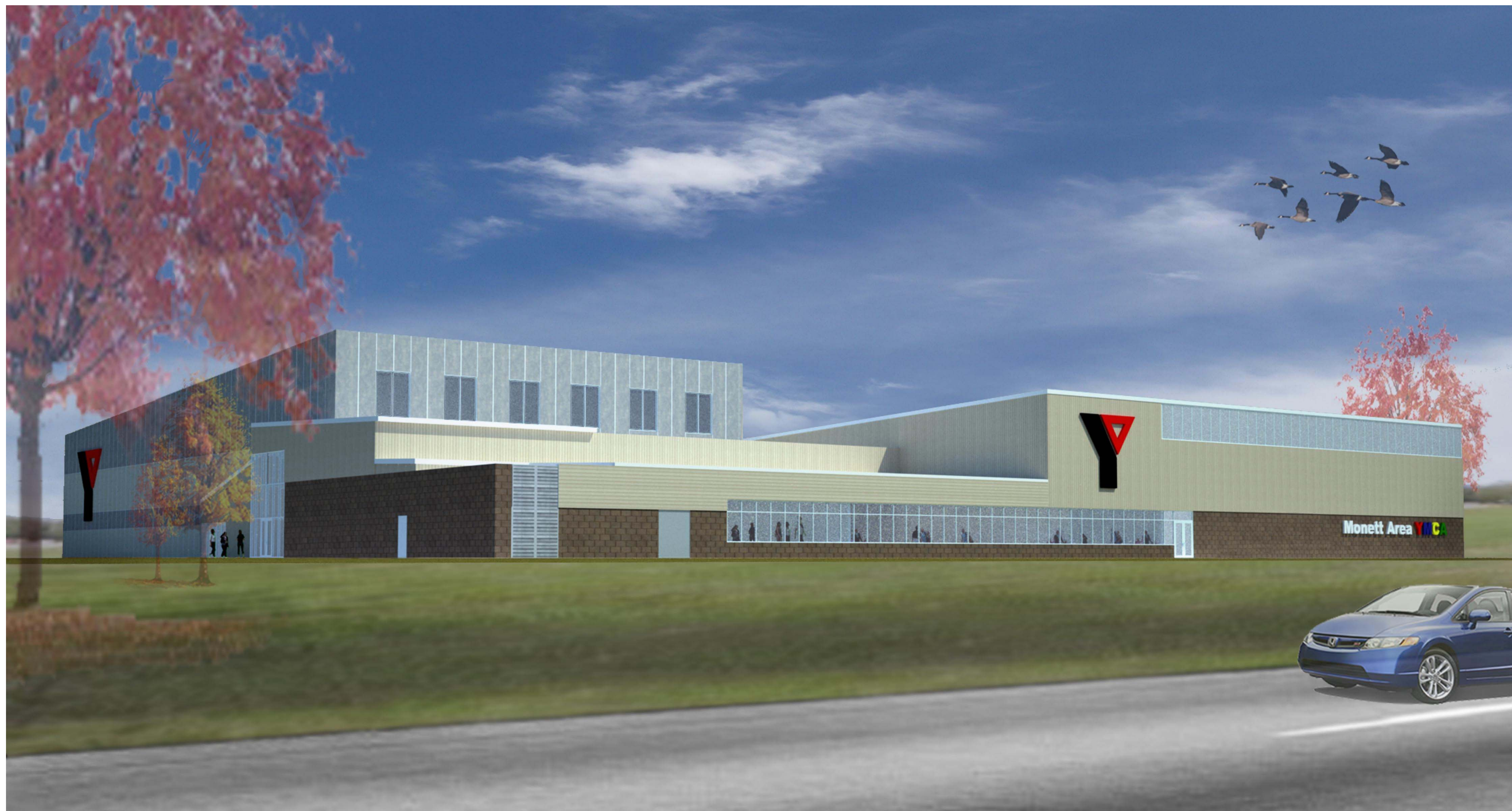
View from Highway 37 looking Southeast Monett Area YMCA